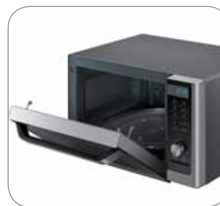
Drop Down Door