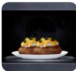
Convection Cooking with Slim Fry™