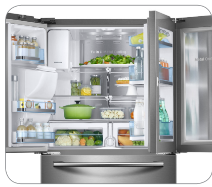
Food ShowCase Fridge Door